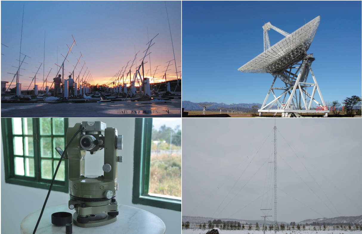
Figure 7. Some other instruments applied by the Meridian Project: (top left) the very high frequency radar array built by NSCC in Hainan, mainly for the monitoring of ionospheric variations; (top right) a radar facility built by the National Astronomical Observatories in Miyun County, suburban Beijing to detect interplanetary scintillations and measure the velocity of solar winds; (bottom left) a magnetic fluxgate theodolite; (bottom right) the digital ionosonde ( digisonde ) installed in northernmost China's Mohe City by the Institute of Geology and Geophysics, Chinese Academy of Science.