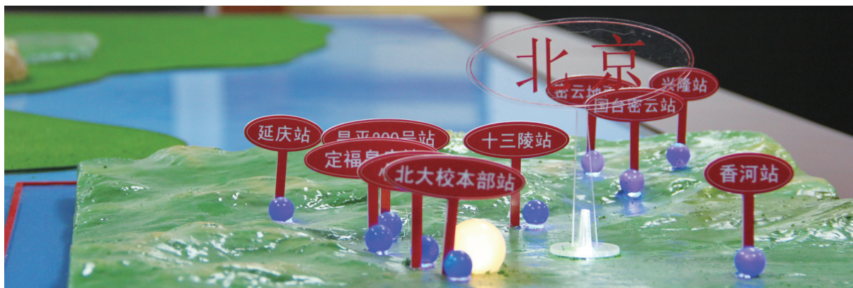
Figure 6. The Beijing Station of the Meridian Project has a total of 10 observing sites under it.

To invent a "common language" for the consortium, Ms. ZHANG Xiaoxi, a chief coordinator of the project, spent more than three months with her colleagues to compile a 60-page manual which details the project's implementation norms, including working and testing procedures, technical standards as well as organizational and management modes. "The 'common language' proved to be a key to pushing