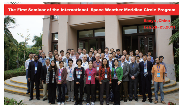
The First Seminar on the International Meridian Project was convened in February 2011 in Sanya, Hainan Province. More than 60 officials and experts from China, the United States, Canada, Russia, Australia, Brazil and the United Nations attended the seminar.